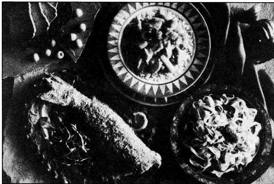
Catfish can be prepared by many cooking methods, including baking, broiling and grilling.

One of the reasons catfish is ideal to use in meal planning is that it can be used so many different ways. The "10 minute rule" says to cook fish for 10 minutes per inch.